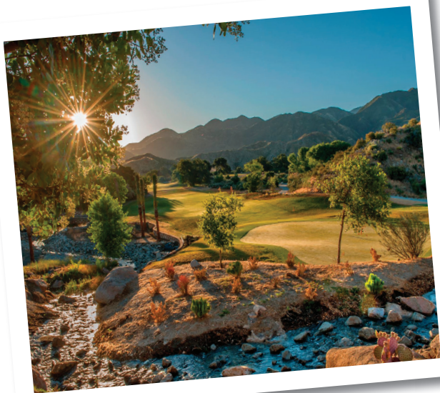
The Desert Course at Sand Canyon Country Club